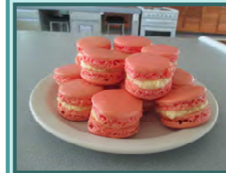
Hospitality cooking up a storm!