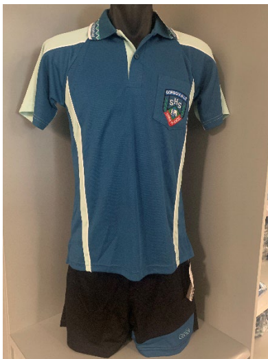
Every Day Uniform