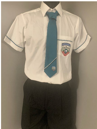
Boys Formal Uniform